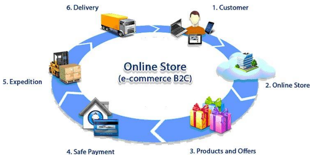
Fig 2: E-Commerce selling process